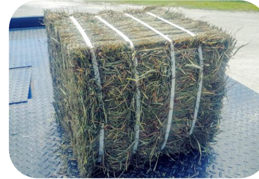
Compressed (small bale)