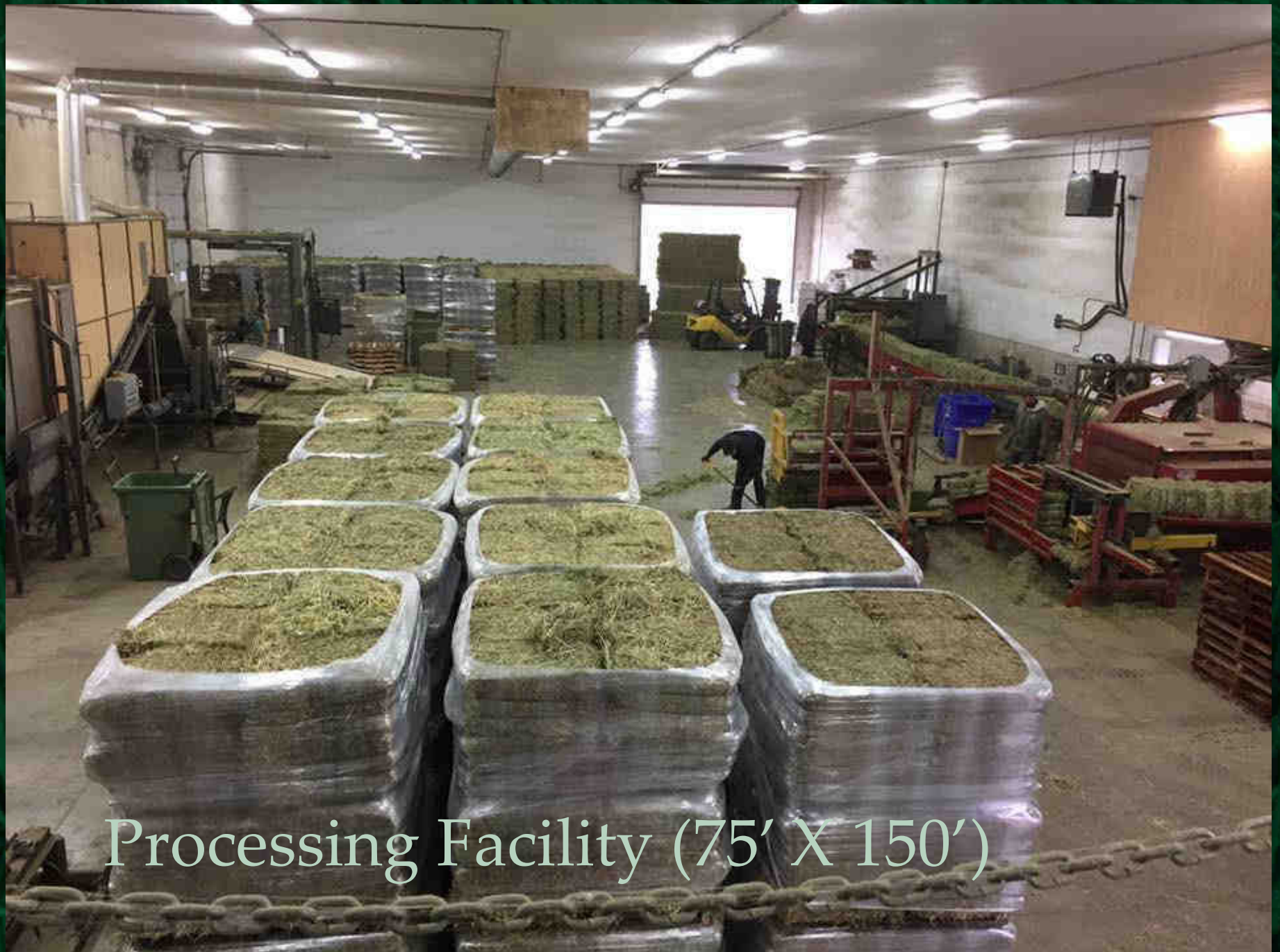
Processing Facility (75' X 150')